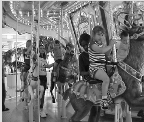
Some Go-Getters enjoy a carousel ride on a recent outing.